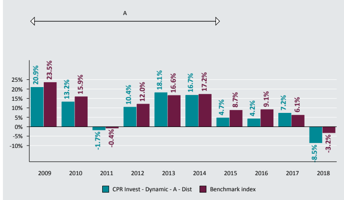
A: Simulated performances based on the performances of the P-unit of the Master Fund.